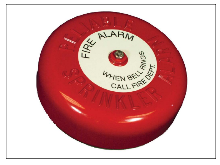
Model C Mechanical Sprinkler Alarm

The alarm continues to sound as long as water is flowing through the sprinkler system. It may be shut off by closing the alarm control valve located in the piping line connecting the mechanical sprinkler alarm with the alarm (wet) or dry pipe valve. Reliable Model C Mechanical Sprinkler Alarm is self setting after each operation, eliminating the need of removing cover plates, etc. to reset internal mechanisms.