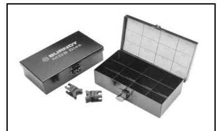
W die case Part# CASEWDIES , holds up to 24 dies