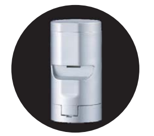
Optional MP-B Buzzer (See pg. 199)