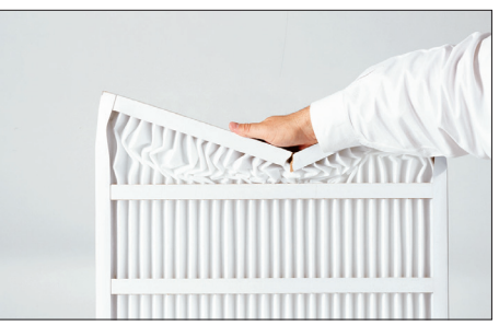
PerfectPleat<sup>®</sup> can withstand significant damage.