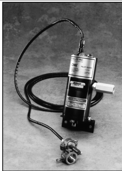
CM7 Pilot Guard

If the pilot flame should go out, causing the temperature-sensing element to cool, the CM7 Pilot Guard will snap closed, shutting off the gas pressure to both the pilot and burner ports simultaneously. In the "off" position, the burner port is open to the pilot port, allowing diaphragm pressure to vent out through the pilot line.